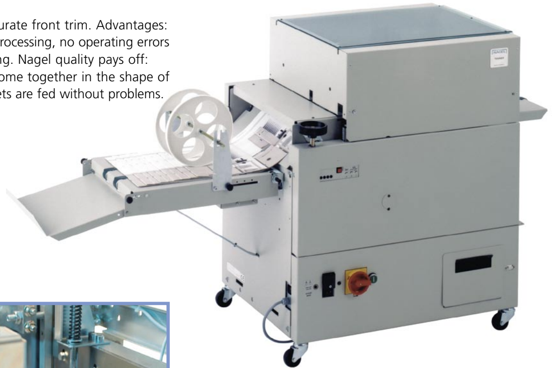
The TRIMMER with pressing station.

■ Gives the booklet an accurate front trim. Advantages: No expenses for staff, fast processing, no operating errors and no intermediate stacking. Nagel quality pays off: The upper transport belts come together in the shape of a funnel – even thick booklets are fed without problems.