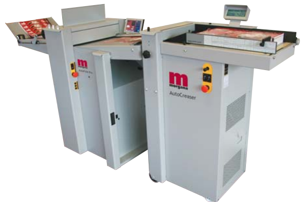
Picture shows AutoFold Pro with Morgana AutoCreaser

The beauty of the AutoFold Pro is its simplicity allowing the user of ANY manufacturer's creaser to invest in one and to improve their productivity and quality immediately.