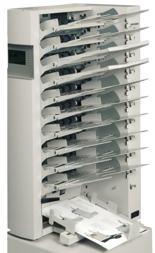
C 510 without air separation