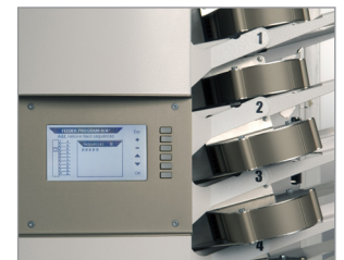
ACF 510 display and fan