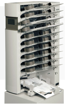
AC 510 with air separation

High capacity user friendly range of feeders & collators for digital and litho printed applications.